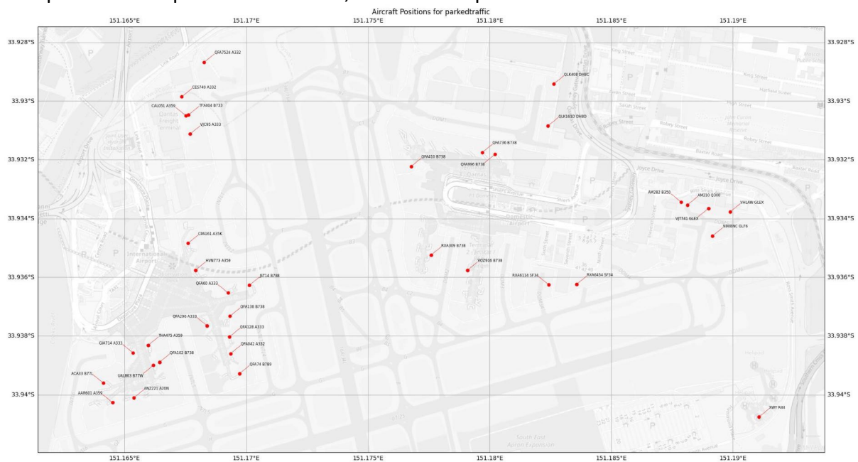
Figure 1 Parked traffic in a 3km radius from the center of YSSY

This prints the output of the API calls, and shows a plot: